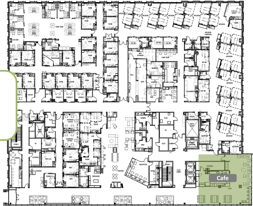
Proposed layout – subject to change.

Phase 1B – 3rd Floor $2 Million Total Investment Fully Funded Cafe